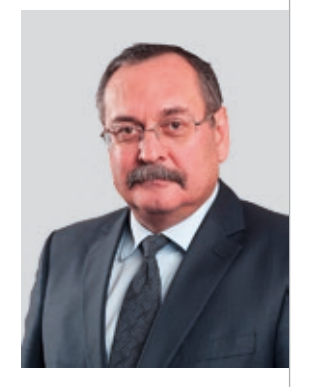
Holds no shares in the Company.

Does not hold positions in other organizations.